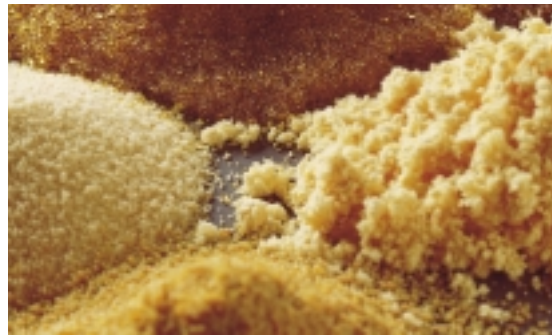
Bead Resin, Powdex and Premix

Powdex resin operating capacity is up to 90% or more of the total ion exchange capacity. In addition to filtration, ionic species such as iodine, cobalt and silica as well as organics are removed.