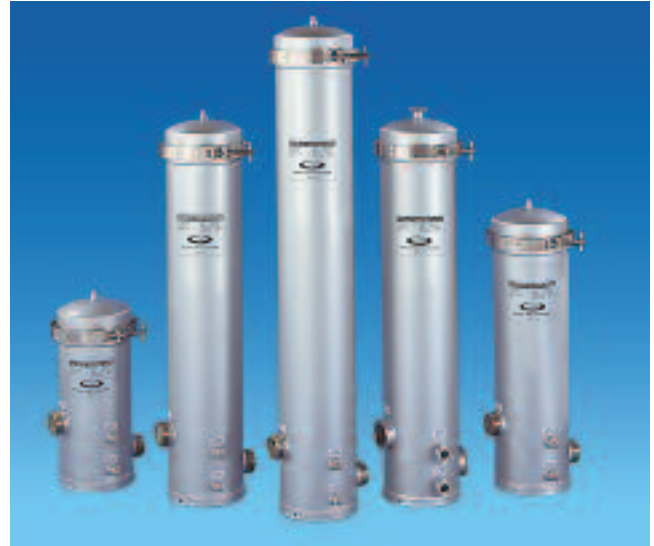
MC Series Multi-Cartridge Filter Housings

316L stainless steel compression seat plate assemblies and tube guides are included with the MC Series